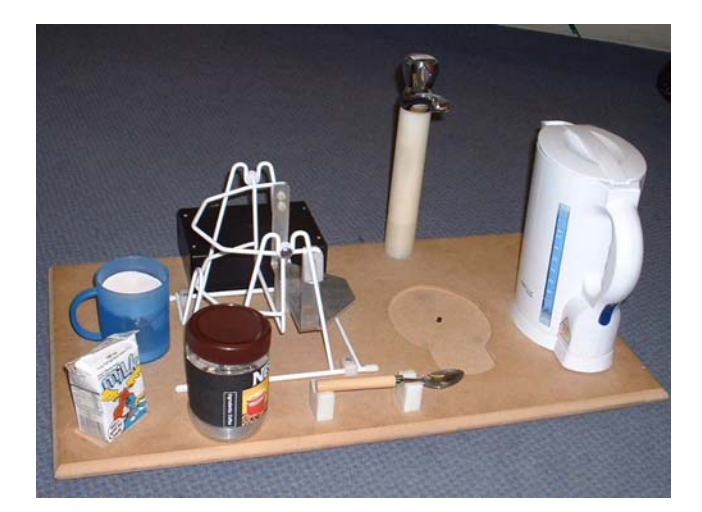
Figure 1. The tangible user interface to a coffee making activity.