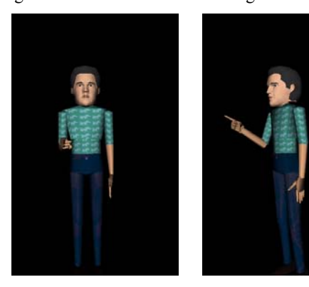
Figure 7. Animation of the "You" sign in ASL using an H-anim avatar

Two frames from resulting animations are illustrated in Figure 7.