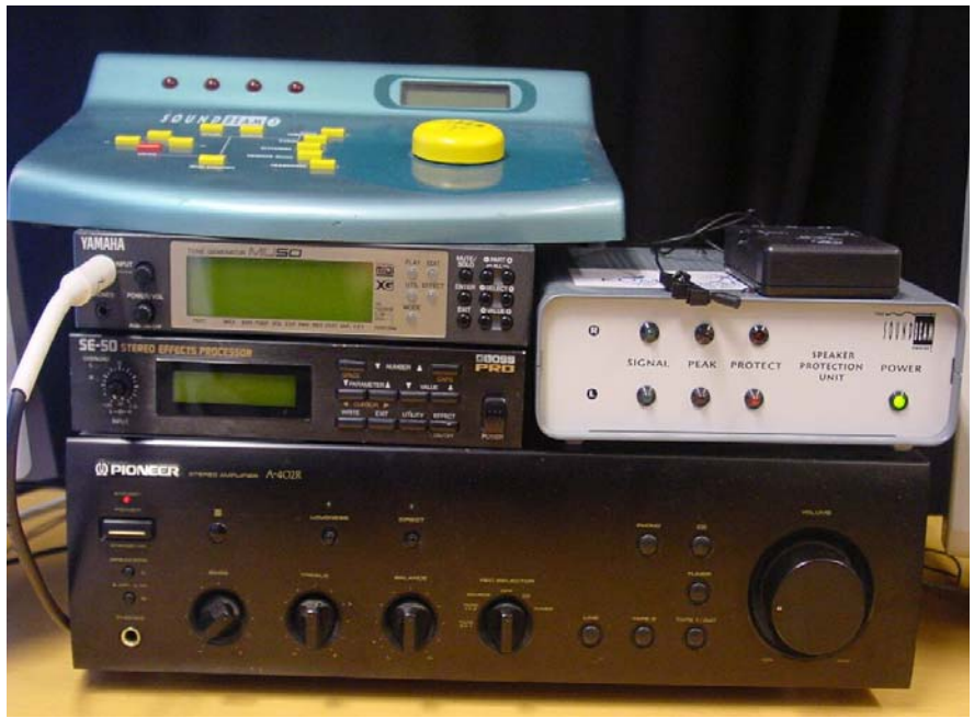
Figure 2 (left) Soundbeam control unit (upper left), stereo sound module and stereo effect processing unit (left middle), speaker protection unit for vibroacoustic soundbox<sup>6</sup> (white) with wireless microphone upon it. All rest upon the main system stereo amplifier

A microphone and a sound processor (Figure 2) were additionally used for collecting Rasmus' utterances so as that he could make strange noise effects from generating his own personal sounds.