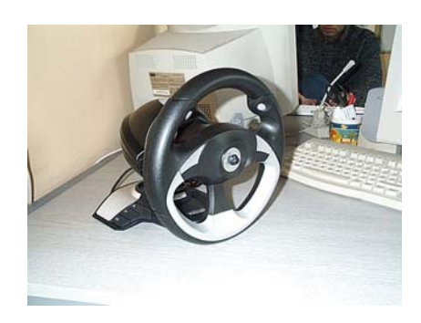
Figure 2. The two handed device.

These were evaluated using a repeated measures design. Each member of the user team worked through four VE with each of the design solutions to enable performance data from each design solution to be compared with their own data from the currently used navigation devices.