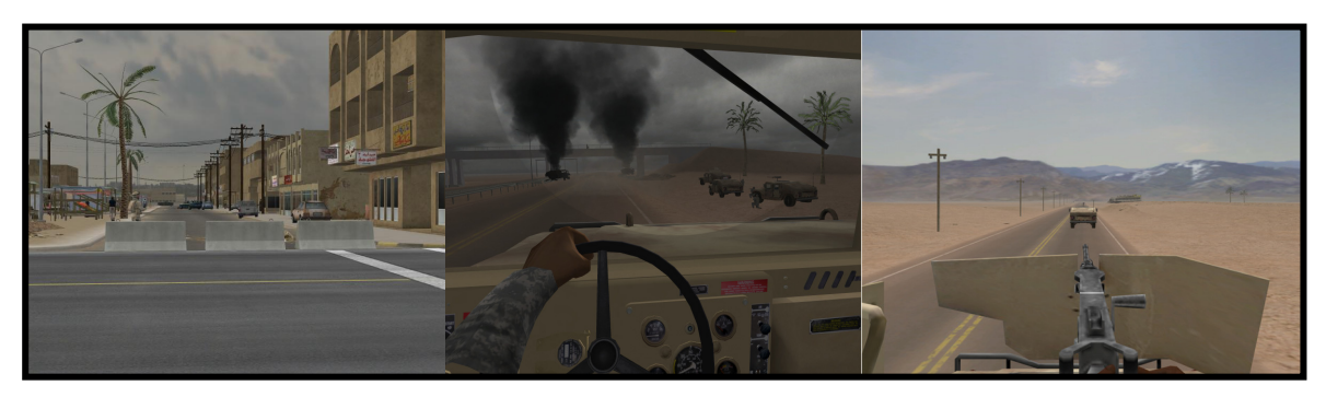
Figures 1-3. Virtual Iraq City, Desert Road and Virtual Afghanistan mountain scenes.

roof of the vehicle. The number of soldiers in the cab of the HUMVEE can also be varied as well as their capacity to become wounded during certain attack scenarios (e.g., IEDs, rooftop and bridge attacks). Both the city and HUMVEE scenarios are adjustable for time of day or night, weather conditions, nightvision, illumination and ambient sound (wind, motors, city noise, prayer call, etc.). As well, we now have created visual elements that can be selected to resemble Afghanistan scenery and architecture in an effort to broaden the relevance of the application for a wider range of SMs.