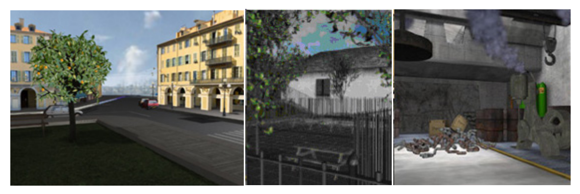
Figure 1. The three virtual environments used in this study. On the left, the city scene, in the middle, the garden scene, and on the right, the factory scene.

We use exterior and interior virtual scenes. The two exterior scenes are a street scene (see Figure 1), with cars passing by and traffic noise; and a garden scene with trees, a house, tables and benches. The interior scene is a large dark hangar, in which different industrial machinery are active and producing contact sounds.