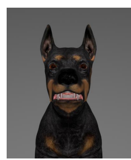
Figure 4. The Doberman dog model, which was selected as the dog to be included in the exposure sessions.

The Doberman was therefore selected as the threatening stimulus for the exposure sessions. Several animations have been developed: running, walking, seating, jumping etc. It also affords growling as well as barking, and the experimenter can control the dog animations with keys. The dog's barking and growling are spatialised in 3D.