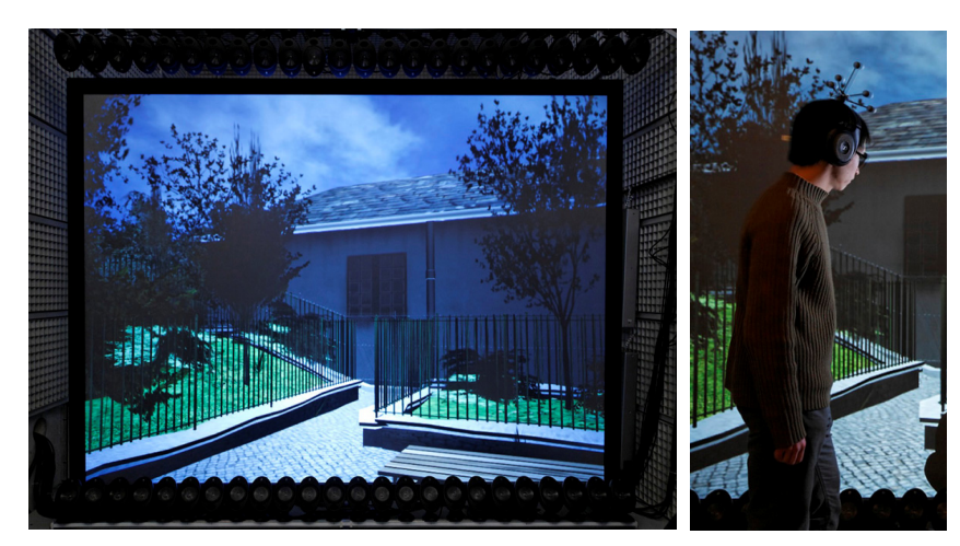
Figure 2. Virtual Reality setup. On the left, view of the entire screen in the acoustically damped studio, on the right, a participants equipped with headphones, a head tracker and polarized glasses.

The sessions take place in an acoustically damped and sound proof recording studio with the light switched off. The visual scenes are presented on a 300 \times 225 cm<sup>2</sup> stereoscopic passive screen, corresponding to 90 \times 74 degs at the viewing distance of 1.5 m, and are projected with two F2 SXGA+ ProjectionDesign projectors. Participants wear polarized glasses.