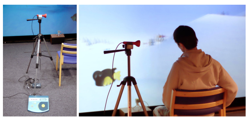
Figure 2. The SoundBeam device – a player steering the penguin with head movements.

The user is positioned in front of the camera which, in our case, was positioned under the screen facing the player so that movement on either side is used to steer the penguin. A minimal level of light on the player is required for the camera to detect motion. Players can wave one or both hand(s), lean on one side, make a step in either direction, or otherwise control via selected gesture. A repositioning of the camera can enable a level of head control. Figure 1 shows the action and the motion detection grid.