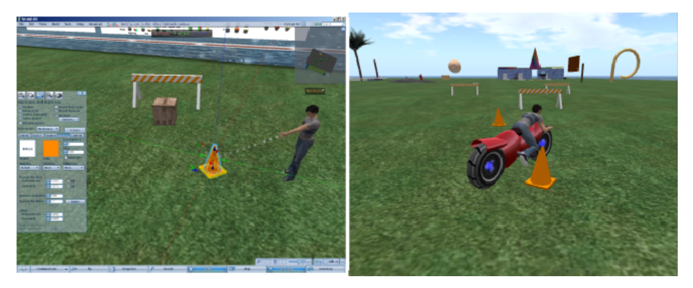
Figure 5. Example of content customization – building a simple obstacle course.