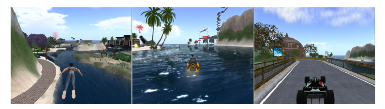
Figure 4. Examples of possible activities in Second Life – navigation by flying, riding a jetski, car racing.

Finally, there are also therapeutic issues with virtual worlds, such as users trained to perform certain tasks in the virtual environment may not necessarily be able to transfer the acquired skills to the real world or users performing significantly differently in the virtual environment due to the effect of anonymity/"mask" provided by the avatar. These issues are not specific to Second Life, though – similar problems face the users of any online multiplayer games when repurposed for the rehabilitation/therapy needs. A good analysis of these issues can be found in Gaggioli et al (2007). Any attempt to use virtual environments for such purposes will have to take these into account.