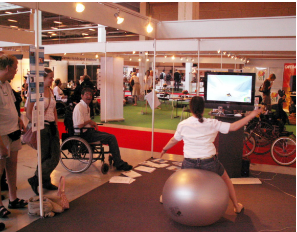
Figure 6. REHAB Scandinavia 2007 and 2008; steering the penguin when exercising on a fitness ball.

It was also observed that the therapists would often test the game and then communicate to their colleagues who were observing of how it would suit to be used for a certain person in their care. This selective referencing to people with impairments at their institute was interesting as they visualised that person in the game scenario and placed themselves into that role, in line with the precept out of the Chicago school of sociology and specifically the work of Robert Park.