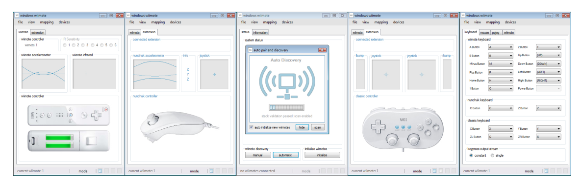
Figure 1. Part of the Windows Wii driver application interface.

2.2.2 The Optical Sensor. The optical sensor is an infrared camera situated at the front end of the Wiimote. The camera is connected to an integrated image analysis chip that can identify up to four individual Infrared light sources and report their position, approximate size and level of intensity. The light sources for the present application are provided in the form of two clusters of infrared LEDs situated at two opposite ends of a stationary bar, which was a modification of an existing USB/battery powered product. The image sensor sees the light as two bright dots separated by a known distance. Triangulation is used to calculate the distance between the bar and the Wiimote. The camera projects a 1024x768 plane front of the user and positional/rotational data is obtained in reference to this plane. This is possible as the position of the sensor bar and distance between the LED clusters remains constant. This system allows the Wiimote to function as an accurate pointing device and provides the yaw value, so that the Wiimote can be tracked in 3D space.