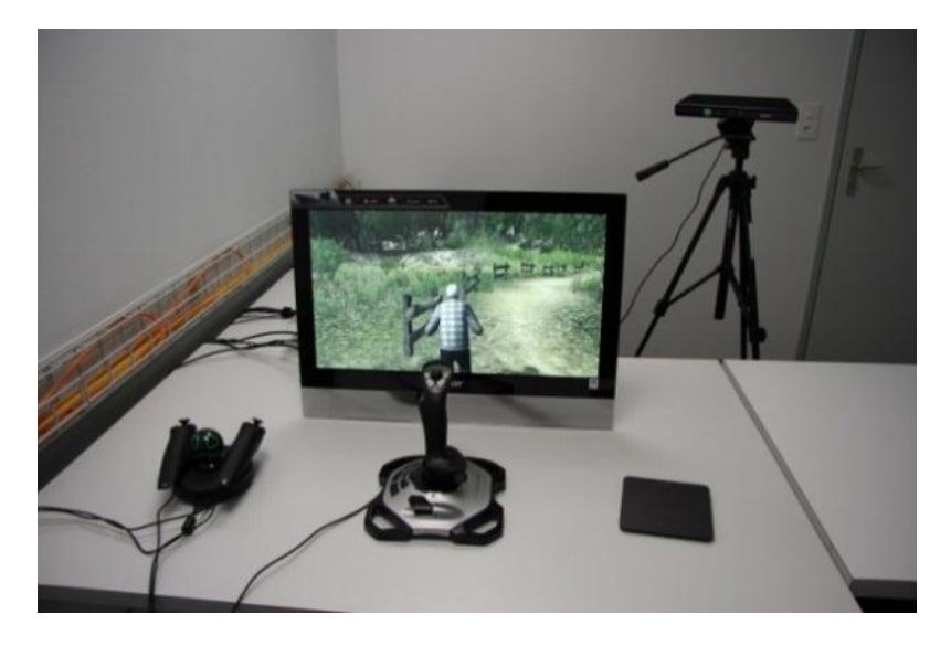
Figure 3. First Study experimental Setup (from left to right: the Razer Hydra, the Joystick, the Touchpad and the Kinect).

moved their finger with several forward small movements. The Joystick was used without the need of using any additional button, as the three other devices.