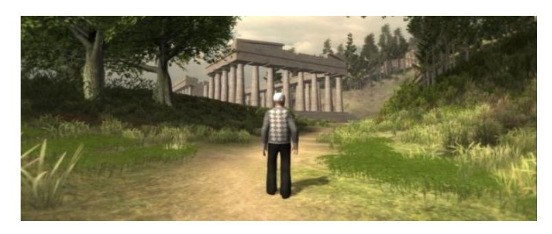
Figure 1. A virtual navigation at the 3D Memory Island until the user reaches the Parthenon landmark.

The 3D Memory Island virtual environment is a virtual reality journey back in time (auto-biographical memory) to landmarks that seniors have previously visited at their lives. We conducted an online survey regarding the most famous or visited cities or landmarks a typical Swiss senior might know or even have visited in his life. See figure 1 for examples of landmarks according to our survey. Based on the above, emphasis is given to tasks that have to be performed at the 3D Memory Island environment incorporating problem–based activities: for instance to prepare a virtual meal, to go shopping for ingredients, to navigate to the landmark etc. The aim of the 3D Memory Island is providing the users the capability of performing everyday activities with virtual reality by assisting the brain to find out alternative methods to execute functions, which are controlled by damaged brain regions. We also place a special focus on adaptive difficulty levels, allowing error-free learning that is expected to increase motivation, fun, and self-confidence.