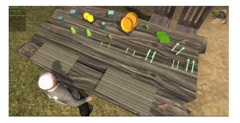
Figure 4. Table preparation task.